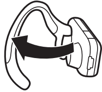
1 Open Earhook